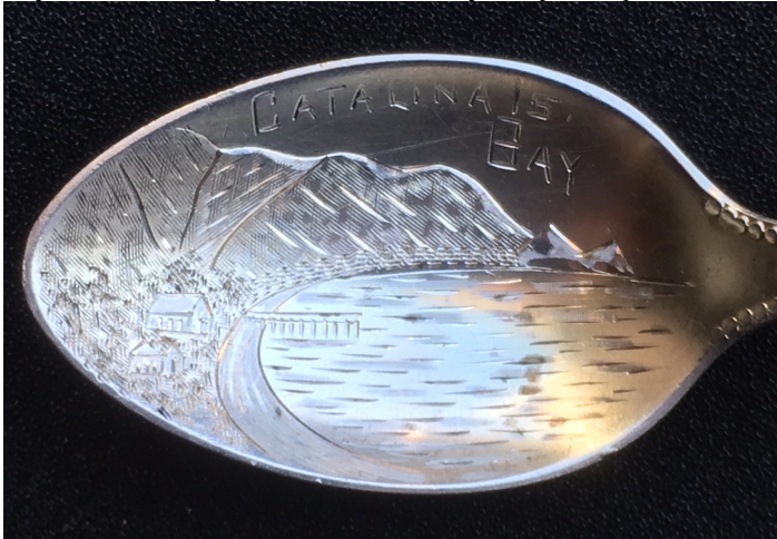
Caption 5, Variety 1 - "Catalina Is. Bay" (C5-V1)

on L.D. Anderson marked Washington pattern "Los Angeles Cal" engraved on handle (post 1903)